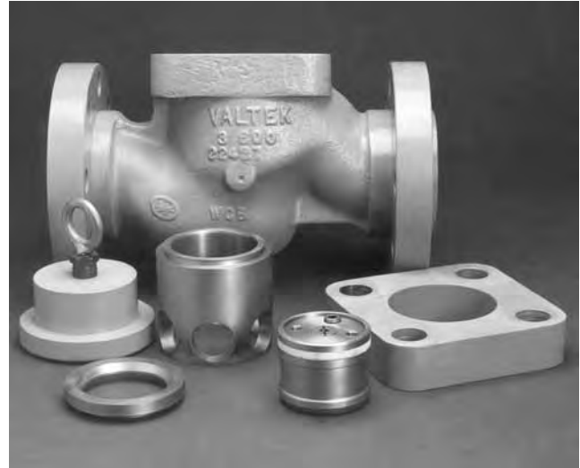
Shown above are the individual parts of the Tek-Check non-slam check valve: (from left to right) bonnet, seat-ring, retainer, piston, and bonnet flange. The interchangeable Valtek globe body is shown in the background.